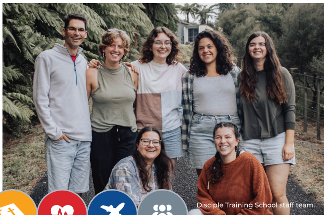
Disciple Training School staff team.