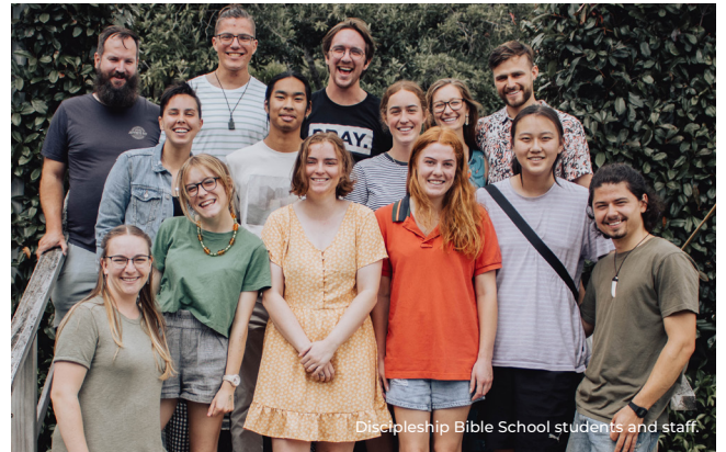
Discipleship Bible School students and staff.

Students will be completing 12 weeks of the lecture-phase, and then the DTS students will go on to have an 8 week outreach-phase through New Zealand.