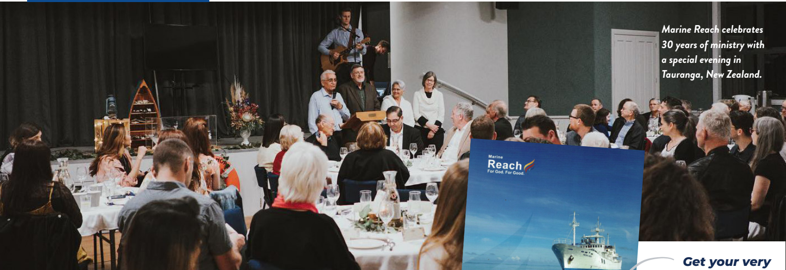
Marine Reach celebrates 30 years of ministry with a special evening in Tauranga, New Zealand.