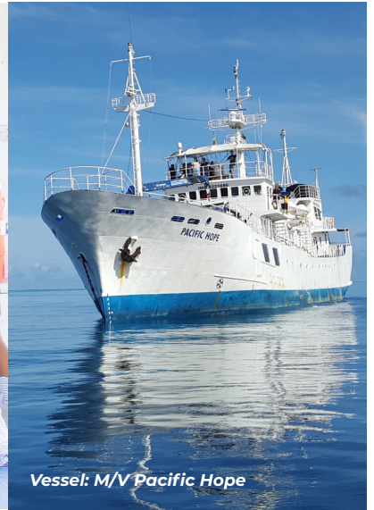
Vessel: M/V Pacific Hope